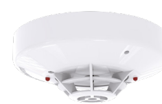
DFJ-CE3 90°C Fixed Temperature Heat Detector