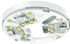
YBN-R/6 Detector Mounting Base