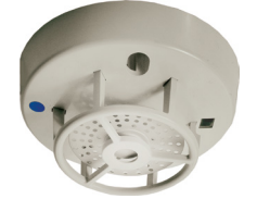
DFG-60BLKJ IP67 Waterproof 60°C Fixed Temperature Heat Detector