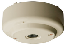
DRD-E Flame Detector