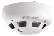
SOC-E3N Photoelectric Smoke Detector