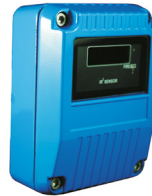
IFD-E IR³ Infrared Flame Detector