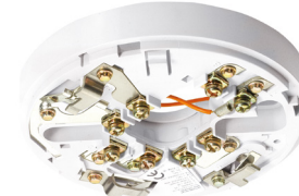
YBO-R/6R Latching Relay Detector Mounting Base