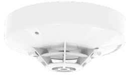
DCD-AE3 Rate of Rise Heat Detector