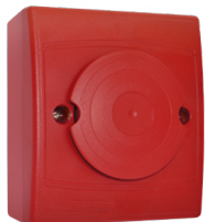
IDENTIFIRE-TS Tritone Sounder