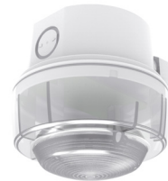
CWST-W Weatherproof Beacon