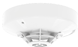
DCD-CE3 Rate of Rise Heat Detector