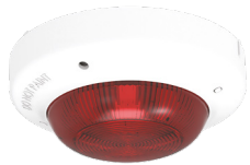
CLB-E Visual Indicator