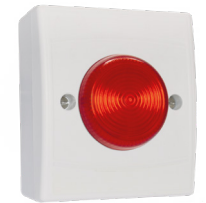
IDENTIFIRE VID Visual Indicating Device (VID)