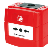
CCP-W IP67 Weatherproof Call Point