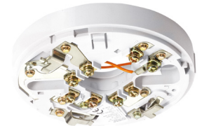
YBO-R/6RN Non-Latching Relay Detector Mounting Base