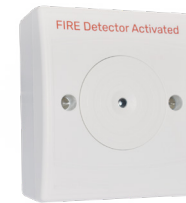
IDENTIFIRE RL Remote Lamp Unit