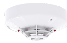
DFJ-AE3 60°C Fixed Temperature Heat Detector