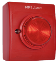
IDENTIFIRE-TSB Tritone Sounder Beacon