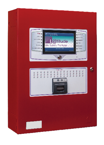
Product appearance varies depending on model selected