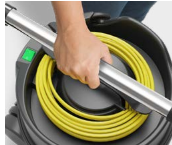
Convenient Carry Handle