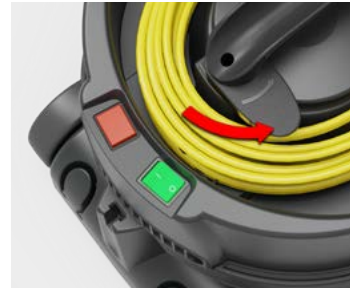
On-board Cable Storage