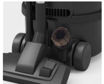
On-board Tool Storage