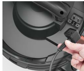
Easy Cable Replacement