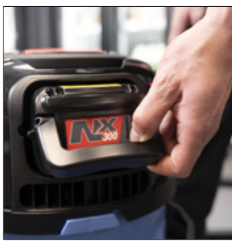
Battery Level Indicator