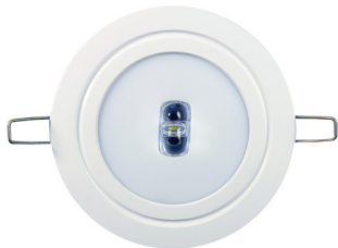
N68R-C-3 Corridor/Escape Route Recessed Luminaire