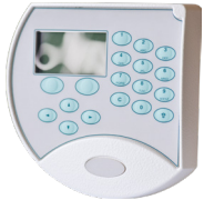
EL-KP Remote Keypad