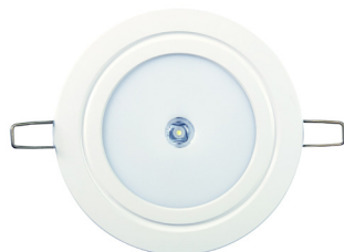
N68R-O-3 Open Area Recessed Luminaire