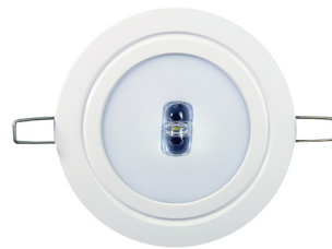
N89R-C High-Powered Corridor/Escape Route Recessed Luminaire