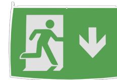
N20GR Exit Sign Lens. Left, Right, Up, Down