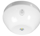
N68-O-3 Open Area Luminaire