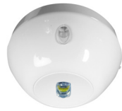
N68-C-3 Corridor Luminaire