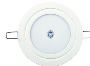
N89R-O High-Powered Open Area Recessed Luminaire