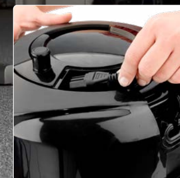
Plugged Cable Easy replacement plugged cable system.