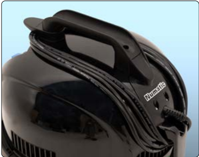
Tidy Cable Storage New handle for cable storage.

Front Switches New front switches for easier access and new handle for cable storage.