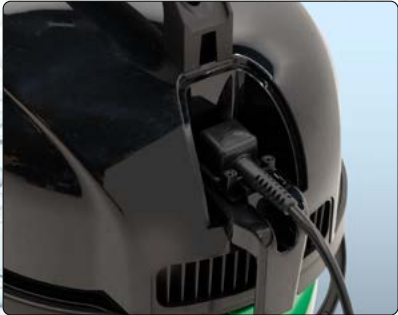
Plugged Cable Easy replacement plugged cable system.

Available on all Wet and CleanTec vacuums 2022.