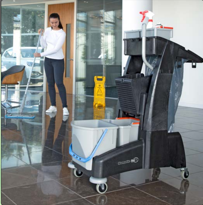
Mopping On-board compact and accessible mopping system, providing on-the-go cleaning.