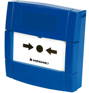
SY-BF01 without BACKBOX