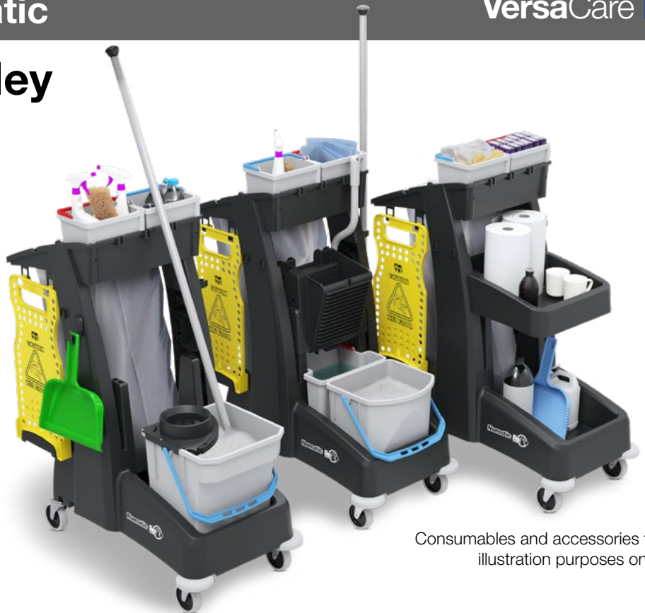
Consumables and accessories for illustration purposes only.