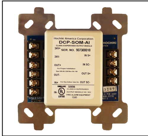
Back side of a SOM-AI

The DCP-SOM-A & -AI shall be supplied with a plastic cover and shall be suitable for mounting to a 4" square or double gang electrical back box. The DCP-SOM-A & -AI shall provide a monitor LED that is visible from outside the cover plate.